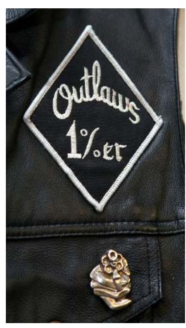
Figure 1. The "one-percenter" patch.

Black OMGs exist, but these groups operate within a different milieu and have their own symbols and values. OMGs composed of African American or mixed race members are less extreme in their entrepreneurialism and organization compared to OMGs composed of white members, and do not use the