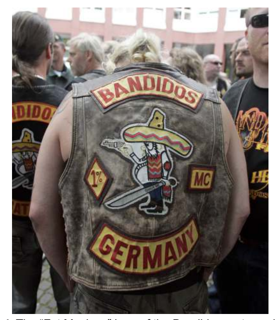
Figure 4. The "Fat Mexican" logo of the Bandidos motorcycle club.

Members may wear tattoos, T-shirts, and jewelry that incorporate acronyms, symbols, or logos associated with the club. 16 Associates may wear "support" jewelry or T-shirts that incorporate a separate set of symbols but use the dominant club's color scheme. For example, the logo of the Outlaws MC consists of a skull and two crossed pistons, but associates of the Outlaws MC may sport a logo that features a hand clenching a pistol, or a Harley-Davidson logo that reads "Support Black & White," as black and white are the two