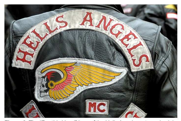
Figure 3. The "Death's Head" logo of the Hells Angels motorcycle club.

smaller clubs affiliated with the larger club. However, not all clubs will have such websites (e.g., Pagans MC):